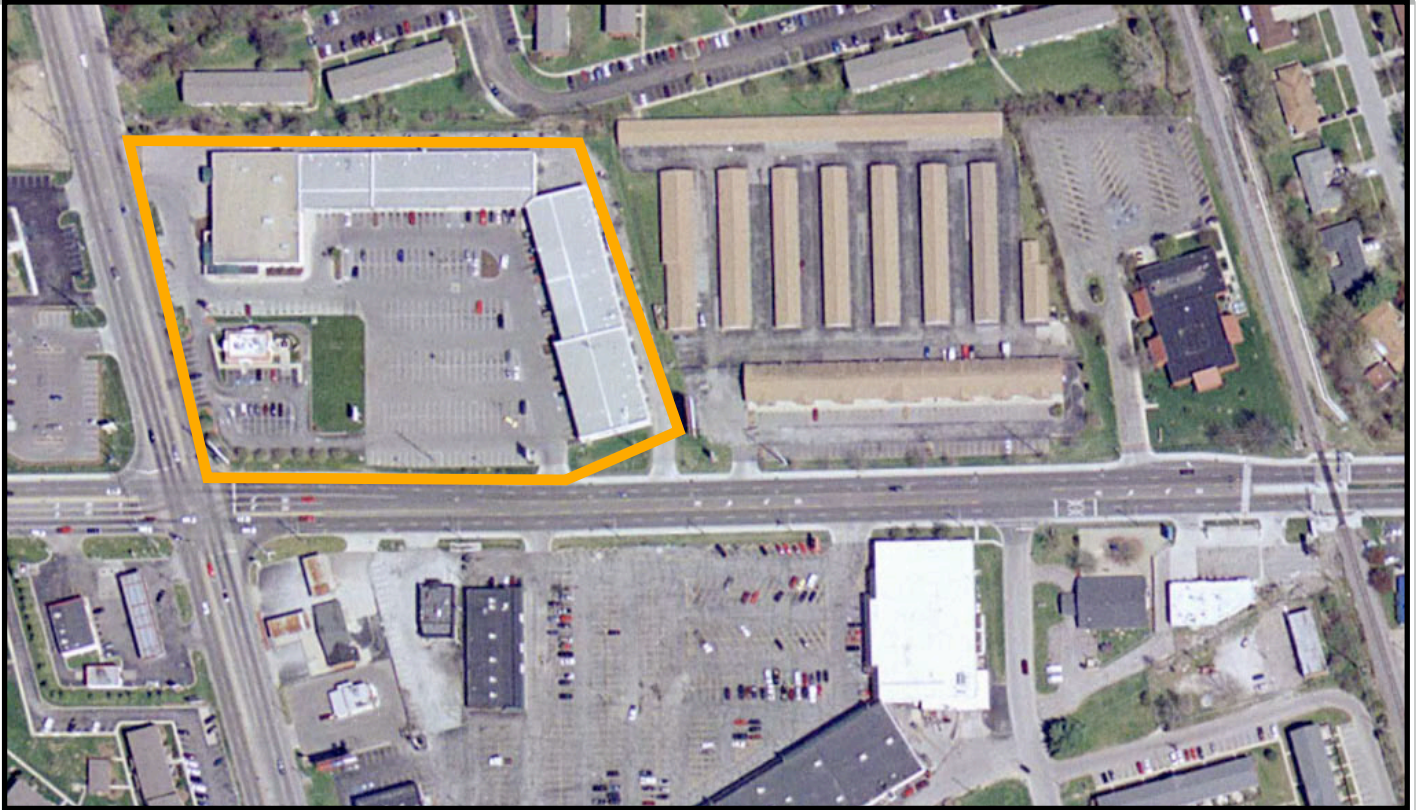
Center at Stop 11